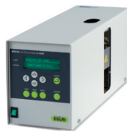
UV-Vis Detector C-640 UV-Vis detection